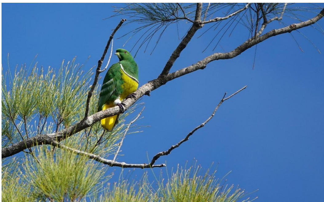
Cloven-feathered Dove from New Caledonia

August 30, Day 4: Bourail area. This morning we will be searching the nearby grasslands specifically for the New Caledonian Grassbird. With a bit of patience, we should have a good chance of seeing our target. Nearby, in more coastal forest we also have a good chance of seeing the beautiful Red-bellied Fruit-Dove.