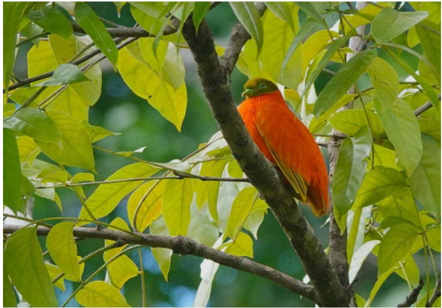
The stunning Orange Dove is only found on the Vanua Levu islands

August 19, Day 6: Fly Apia to Nadi and on to Taveuni. Today we will depart Samoa for Fiji. It is roughly a two-hour flight between the two islands. We will depart Apia on flight FJ252 (subject to change), arriving in the Fijian hub of Nadi, before transferring to the outer island of Taveuni via another short flight aboard FJ151 over some stunning tropical seas. We should have plenty of time to enjoy our lovely resort and do some local birding along the western coast of Taveuni. There is excellent snorkeling just off the beach in front of our hotel.