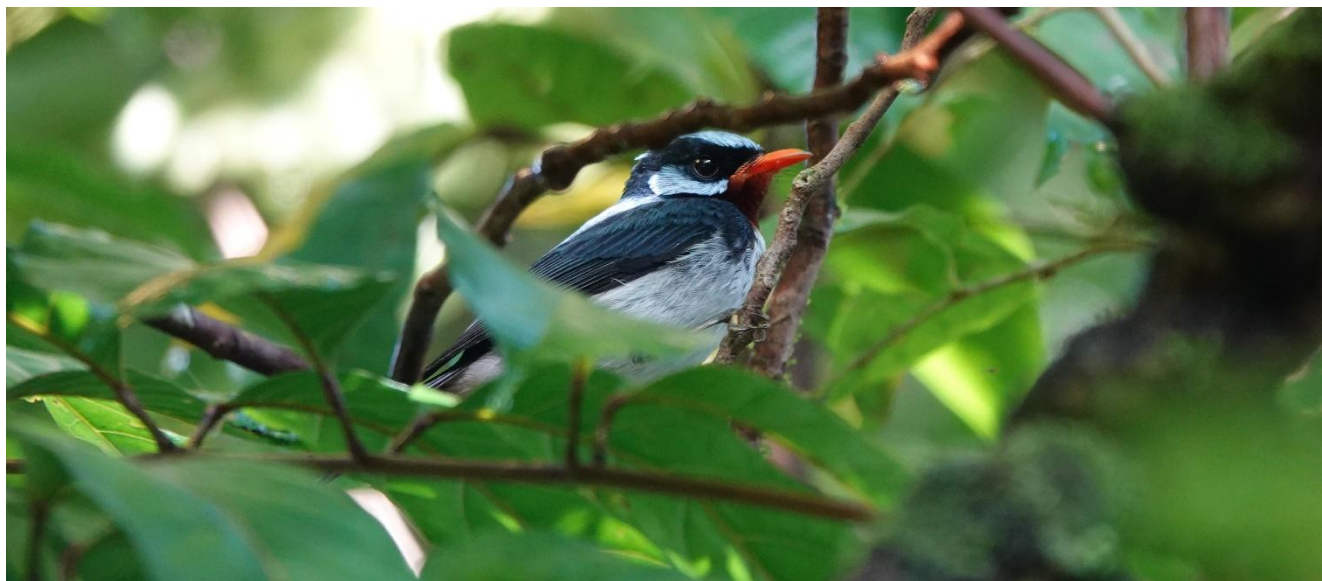
Azure-crested Flycatcher from Taveuni

August 24, Day 11: Suva to Kadavu. Today we will visit our second outer Fijian island, Kadavu (pronounced “Kan-da-vu”). This is a true tropical island experience, as we stay at a remote, but well-serviced island resort where most of the specialty birds can be found right around the grounds.